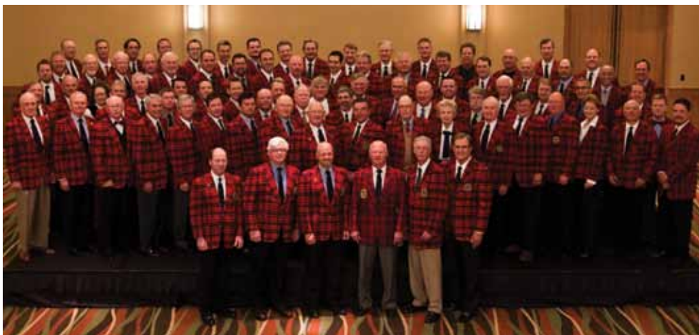
2011 ASGCA Annual Meeting – Denver, Colorado