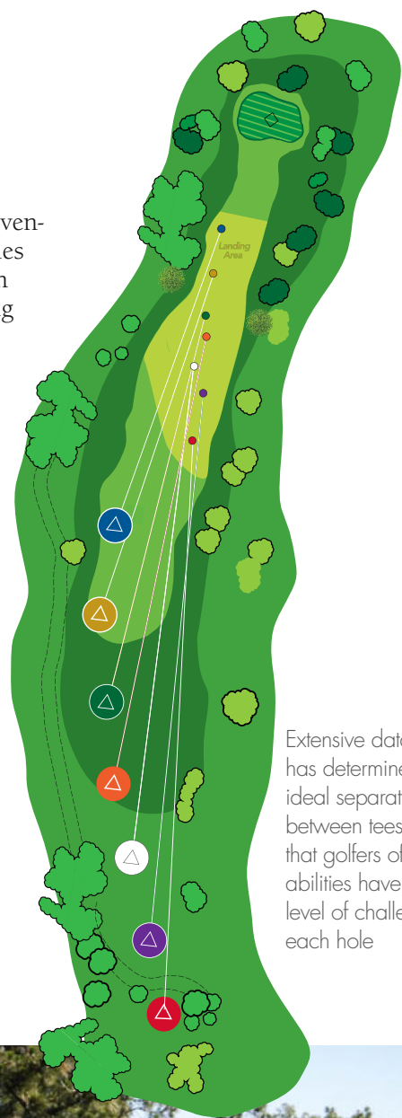
Extensive data analysis has determined the ideal separation between tees to ensure that golfers of varying abilities have a similar level of challenge on each hole

The back tees and more heavily-used middle tees may hold more than one set of markers each, and are respectively about 800 sq. ft. and between 900-1,200 sq. ft. each. The forward two-to-three sets of tees are smaller, approximately 400 sq. ft. each.