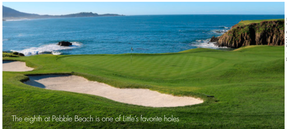
The eighth at Pebble Beach is one of Little's favorite holes

We are thrilled with the ASGCA Foundation's new Lingleaf Tee Initiative, so our family foundation has pledged US$75,000 to support the project. ●