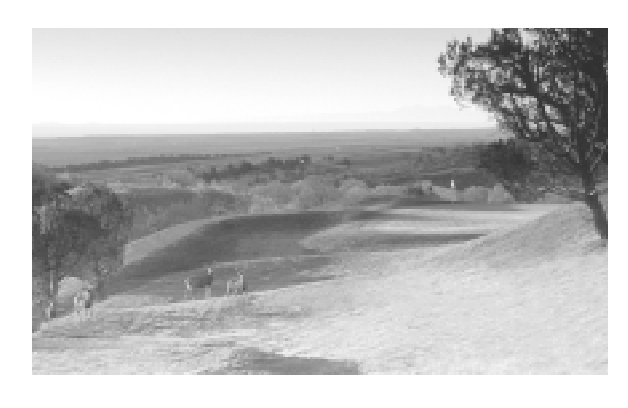
"Every golf course should maintain a relationship with an ASGCA member. A golf course is a living and breathing entity...its design needs constant input from a professional."

With this skill set comes a unique perspective. A golf course architect, retained early in the development process, will help guide the process in an efficient manner from start to finish.